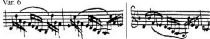
Ex. 14 Var. 6

Another technique is that of extrapolation. This occurs between variation 6 (from measure 49 to measure 51) and variation 8 (from measure 65 to measure 68). In variation 6, the tetrachord in the lower voice in the original takes the tenor voice in the transcription, while notes taken from variation 8 fill the bass (within squares in the example). The purpose of this extrapolation is to solve a technical problem inherent to the guitar idiom. The thirds in the original in variation 8 cannot ‘speak’ properly due to the small rhythmic values and the register in which they are presented in the guitar. Since variations 6 and 8 share the same harmonic progression, it is proper to extrapolate these notes.